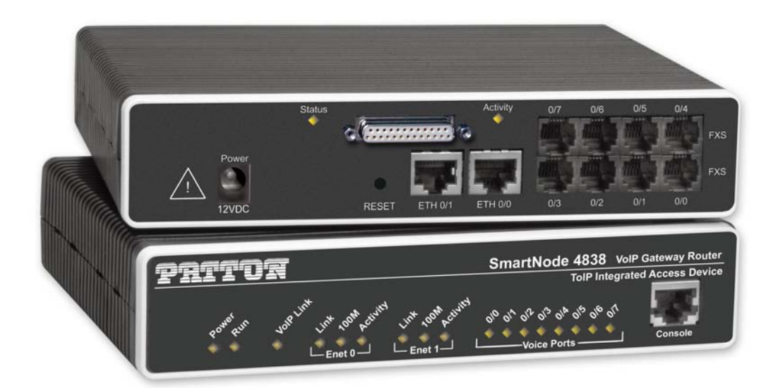
Figure 1. SmartNode product (SmartNode 4838 shown)

This Quick Start Guide leads you through the basic steps to set up a new SmartNode (see figure 1) and to download a configuration. Please note that this guide does not replace the detailed Software Configuration Guide and the Getting Started Guide on the CD-ROM and available online at www.patton.com/voip.